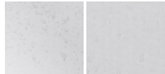
Coated glass without surface treatment